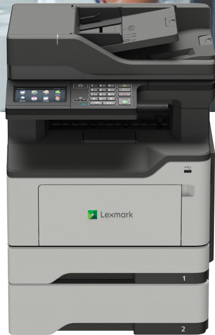
XM1242 with optional tray