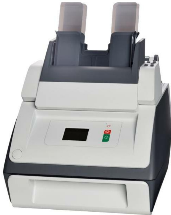
FPI 600 Tabletop inserting system

Fold, insert and seal – 10x faster than by hand.