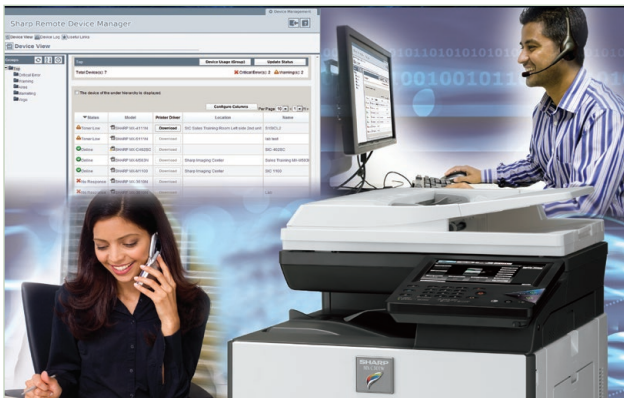
Sharp Remote Device Manager.