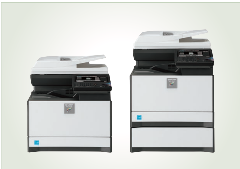
Expandable paper capacity stores up to 800 sheets.