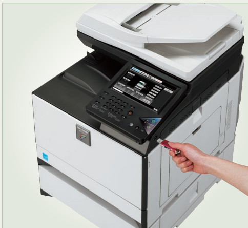
An easily accessible USB connector allows for simplified printing of PDF files from common USB thumb drives.