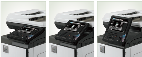
Multi-position tilt screen allows for adjustment to a convenient viewing position.