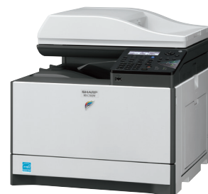
MX-C300W shown with optional 500-sheet paper tray (left) and standard configuration (right).