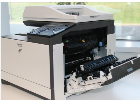
Convenient access to paper path from side panel door makes it easy to clear misfeeds.