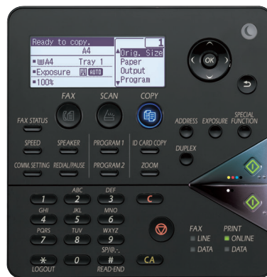
MX-C300W control panel.