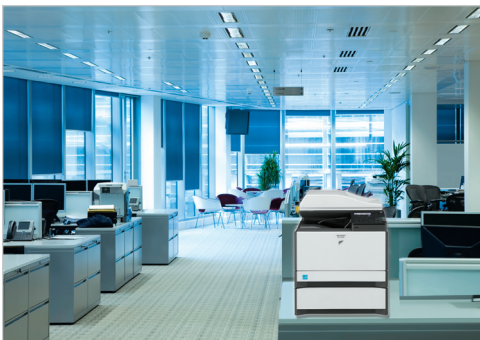
Compact yet powerful enough for workgroup environments.