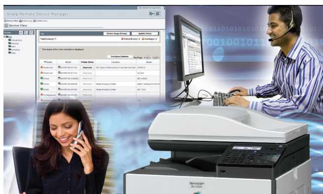
Sharp Remote Device Manager