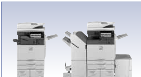
MXM6071 shown in both a compact configuration with inner finisher and full configuration with saddle-stitch finisher and large capacity cassette.