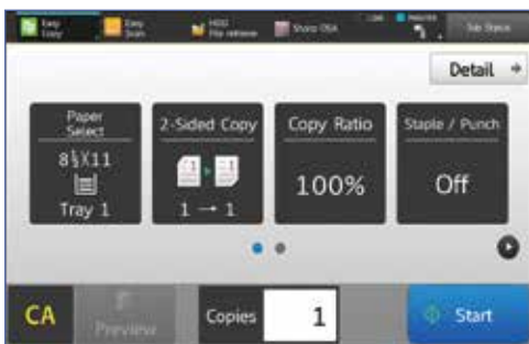
Easy Copy Screen offers the most commonly used settings.