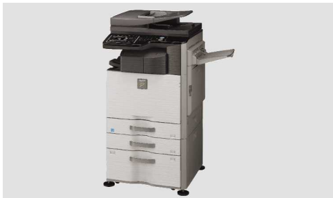
Available paper capacity stores up to a maximum of 3,100 sheets with options