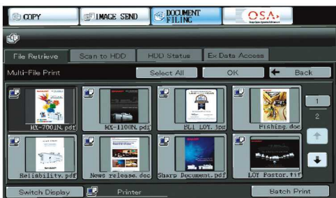
Sharp's easy-to-use Document Filing System with thumbnail preview

Sharp's MX-2615N/MX-3115N will help elevate workgroup performance and meet on-the-go business demands.