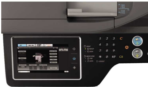
High-resolution touch screen with Stylus pen for easy point-and-touch operation