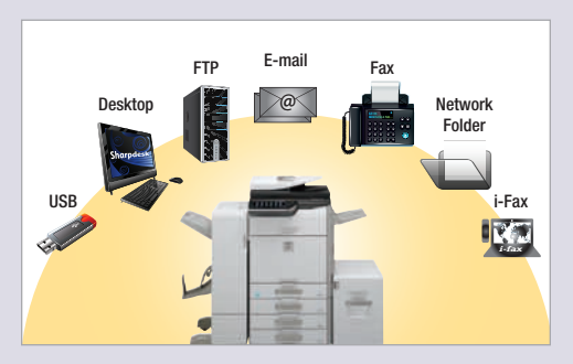
Sharp's integrated network scanning offers one-touch document distribution to up to seven destinations.