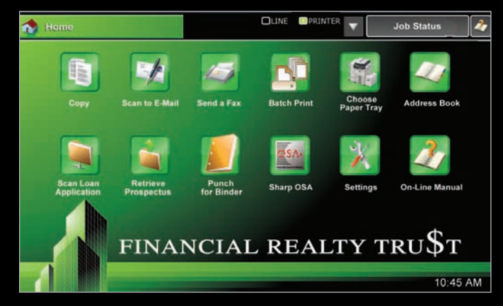
For Financial Environments: Store and retrieve monthly financial reports, scan loan applications and more.