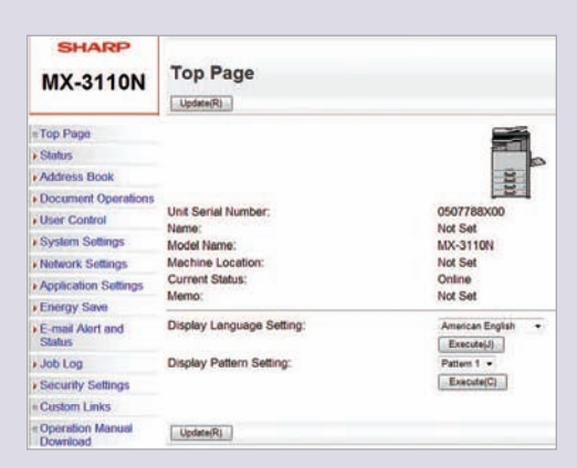
Embedded Web Page.