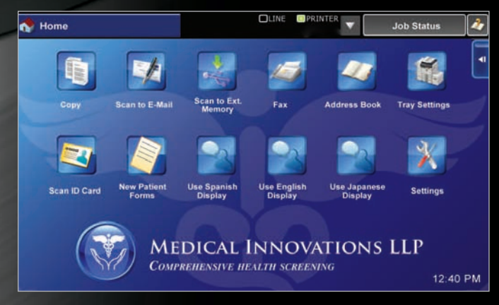
For Medical Environments: Set up custom keys to store and retrieve insurance information, prescriptions and more.