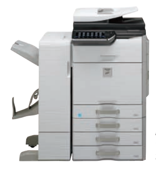
MX3610N shown with saddle-stitch finisher.

The MX series offers a choice of two high-performance finishers that can give your documents a professional look and feel. Choose from a compact inner finisher or floor-standing saddle-stitch finisher . Both finishers offer three-position stapling and an available 3-hole punch.