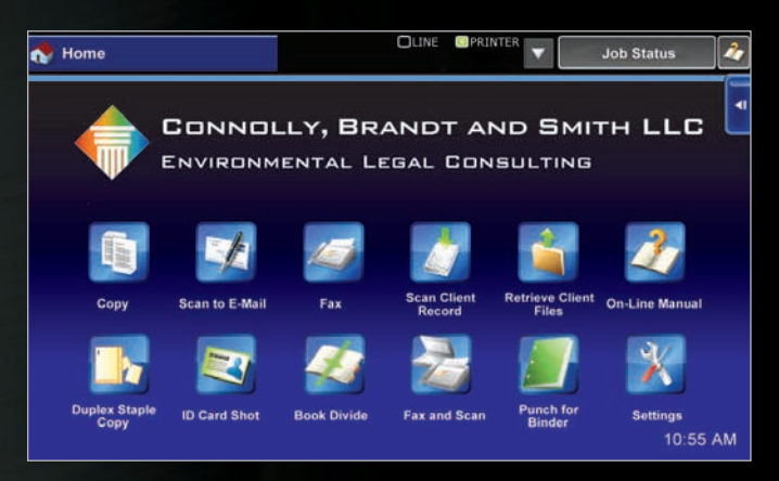
For Legal Environments: Set up custom keys for client files and other frequently used functions.