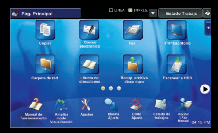
Change the Language: Walk-up users can choose from 24 different display languages with just a few key strokes.