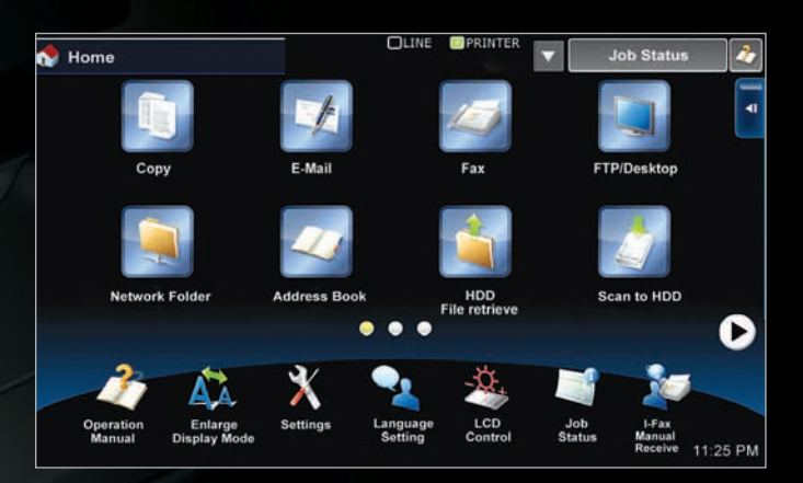
Change the Theme: Easily change the menu colours and Icon layout to suit the preferences of users in your office.