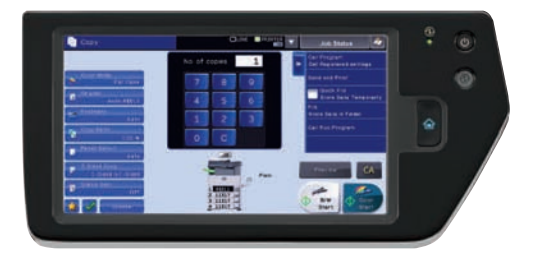
Intuitive copy screen shows options on the left and menu guidance on the right.