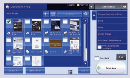
Sharp's document filing system with thumbnail preview makes it easy to locate and retrieve stored jobs.