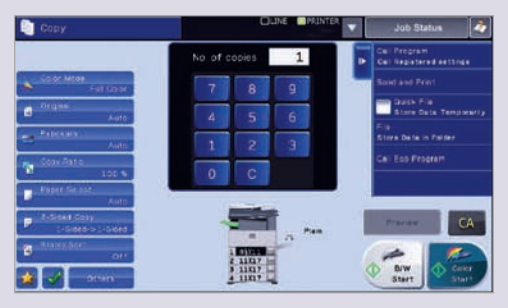
Remote Front Panel.