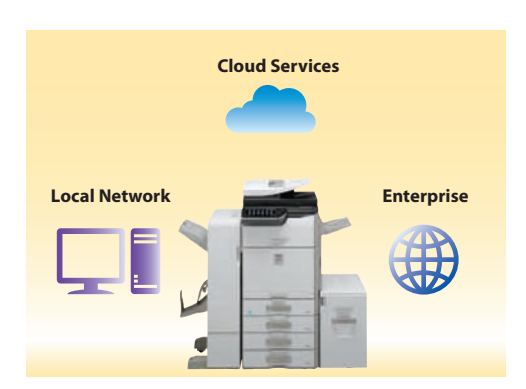
Sharp OSA Technology allows businesses to leverage the power of their network applications, back-end systems, even cloud-enabled services.