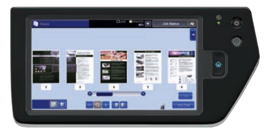
Easily edit documents in scan preview mode.