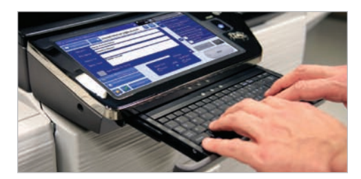
Full-size retractable keyboard simplifies data entry.