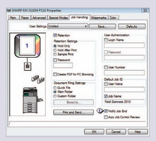
With Sharp's advanced job handling, you can retain print jobs on the MX hard drive for reprinting at a later date, you can even choose to create a PDF for browsing the thumbnail from a PC.