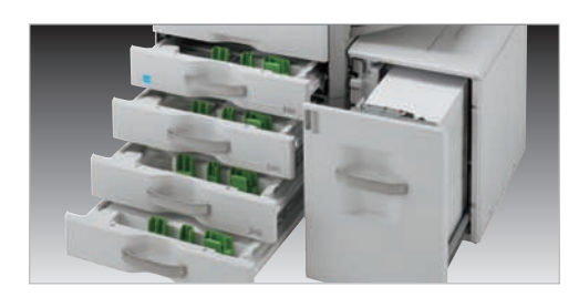
Available paper capacity stores up to 5,600 sheets.